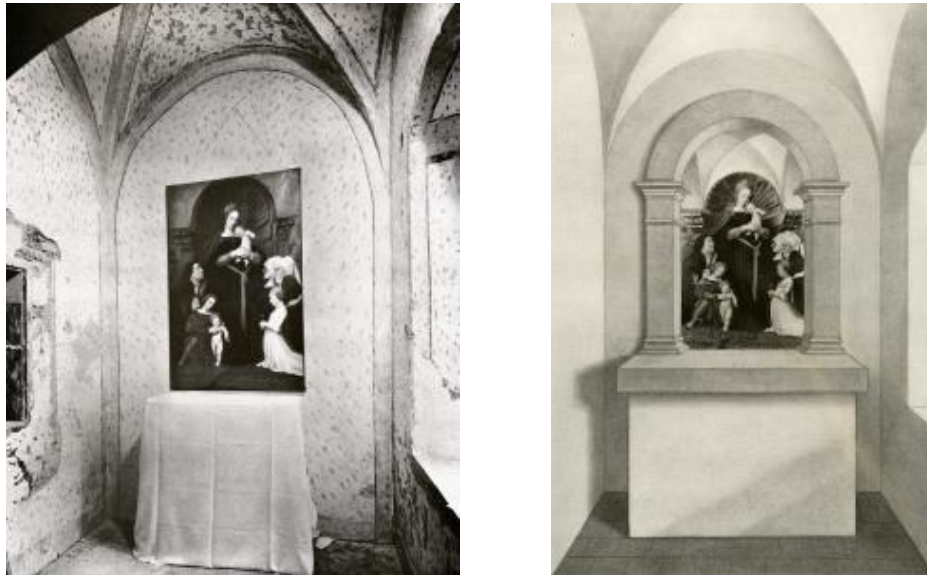
Figure 11 Hans Reinhardt, reconstruction of the original installation using Grüder's copy of 1860, Basel 1954. Hans Reinhardt, "Die Madonna des Bürgermeisters Meyer von Hans Holbein d. J., Nachforschungen zur Entstehungsgeschichte und Aufstellung des Gemäldes," in Zeitschrift für schweizerische Archäologie und Kunstgeschichte 15/4 (1954/1955), 244-254, plates 82 and 83.

historian explained the disadvantageous impression as resulting from the painting's lacking its original frame as an 'inalienable part' 56 and therefore designed an alternative to the later, baroque surrounding (fig. 10). In 1954, when the Darmstadt picture went to Basel on loan, Hans Reinhardt used the opportunity to take up this topic himself. Meanwhile, the baroque frame had itself been destroyed, so that Reinhardt as well could not avoid detecting a deficiency in the painting's mode of appearance. He simplified Schmid's design, and on its basis developed an argument for an original hanging of the Holbein Madonna in the chapel space of Jakob Meyer's Basel estate (fig. 11). The description permits no doubt as to the art historian's motivation: once again, the objective is to work against the contrast between the two paintings by relativizing their differences --- even though it had already been 40 years since the Dresden picture was definitively denied attribution to Holbein. At issue here is the image's history and reception, not its attribution.