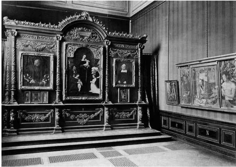
Figure 9 Mise en valeur of the Dresden Madonna in the so-called “Holbein-Saal” [Holbein Room], photograph ca. 1900. Harald Marx, Gemäldegalerie Alte Meister Dresden , vol. 2, Illustriertes Gesamtverzeichnis (Cologne 2005), 36.