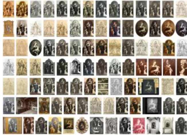
Figure 12 Original reproductions of the Holbein Madonna, selection from 1635 through 1954.

The Holbein controversy is the visual testament to a wide-reaching orientation to images (fig. 12). The pleasure in images that emerges from the early representations shows itself as a noteworthy reflection of the dispute: only in the side-by-side viewing of the pictures do the complex interferences between original, copy, and reproduction become manifest. The surviving original-reproductions join together into a revealing composite image, through which the Holbein controversy emerges as a testament to an active will to images. The panorama of 'interpretations of effect' attests to a fascination of creative variation and breaks apart established representational hierarchies between original and reproduction. The images' historical entanglements take precedence over the unique image, and the perspective of inter-iconicity over fetishism of the original. Instead of becoming the projection screen for a one-sided auratization, the single image, in the course of being viewed together with other images, emerges from the iconic cosmos in a state of enrichment.