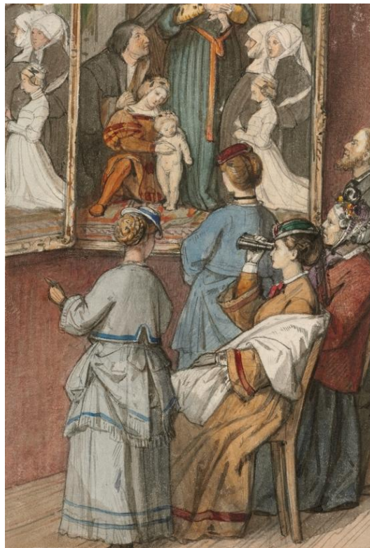
Figure 1 Alfred Richard Diethel, Visitors at the Holbein Exhibition , 1871. Staatliche Kunstsammlungen Dresden, Kupferstich-Kabinett, Inv.-Nr. C 1985-84, Photo: Herbert Boswank.