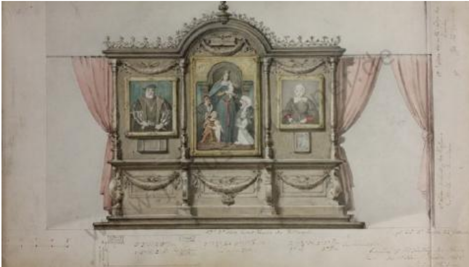
Figure 8 Julius Hübner, Design for the installation of Holbein's Madonna in the Dresden Gemäldegalerie, 1857.