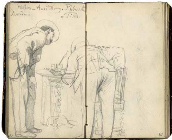
Figure 4 Adolph Menzel, "Holbein-Ausstellung, Plebisit-Tisch" [Holbein Exhibition, plebiscite table] Dresden, 1871. Berlin, Kupferstichkabinett, Inv. SZ Menzel Skb. 36,1871/75, pp. 59–60

other items exhibited, but simply two men at the 'plebiscite table' (fig. 4). 28 Menzel is among the renowned figures who visited the exhibition in Dresden in 1871. However he did not support the artists' majority vote and instead openly sided with