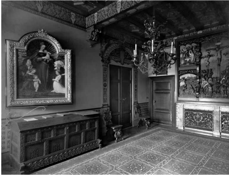
Figure 7 Joseph Magnus, Holbein Room in Darmstadt Residenzschloss, photograph ca. 1900. Hessisches Staatsarchiv Darmstadt, folder R 4 no. 18764.

attached to the subsequently destroyed Baroque frame, which was not the original frame from the time of Holbein, but which contained the painting during the Holbein controversy). Here, too, the mobile mounting elicited variation, inviting the viewer to perceive the painting in motion: its manner of appearance could be modified according to the angle of light and of view. These manipulations to the picture are characteristic of the Holbein controversy; with them, a changing mode of appearance was tested for both original and copy.